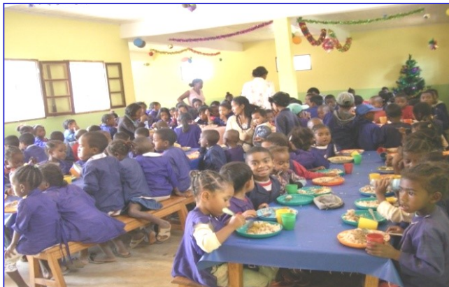
More than 200 children eat at the school canteen.

We widened our tent in order to offer greater opportunity with the construction of a new building. Since climate change in our country now affects both the rainy and dry seasons, the main income of small-crop farmers suffer.