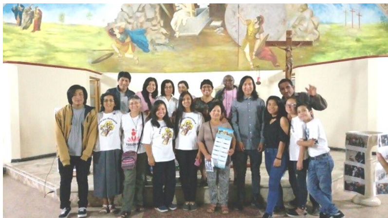
Triduum on Vocation

Youth for Wisdom desire to delve deeper in the love and presence of the Lord in everyday life, in times of reflection and sharing around the table of our community after each meeting. Also, Wisdom is present in the celebrations organized by the Daughters of Wisdom on significant days for the Congregation and during activities of vocation awareness.