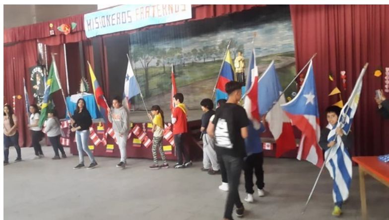
Procession with flags

A great desire to get to better know Blessed Marie Louise of Jesus and her mission was expressed. Moreover, were also expressed desires to work for Montfortian vocations and for different vocations, to live Montfortian spirituality in our Entities and to face the challenges present in our current Latino-American society.