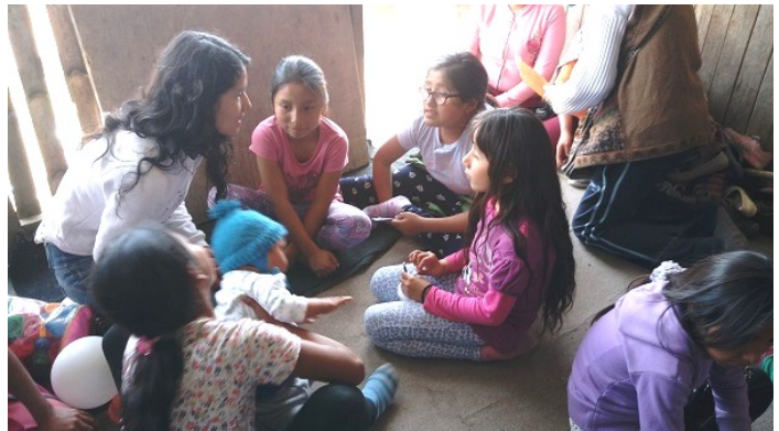
Sexual abuse of Children prevention.