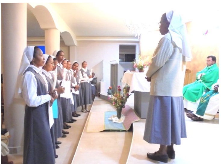
Nine Sisters renew their vowa

The following day was the great day! Fifty Daughters of Wisdom, the Montfortian family and the Sisters' families gathered for a solemn mass. According to a Malagasy tradition the novices ask their families to bless them. Then, each novice, freely pronounced her vows. The Sisters celebrating their Silver Jubilee followed, by renewing their "Yes", with faith and courage.