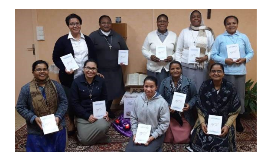
Wisdom Year Community

Energized, we will as best as possible put in action our Wisdom Year theme 2018-2019, « Remain strongly rooted, in the love of Christ. » (Ephesians 3:17) in choosing interculturality in our daily community life. »