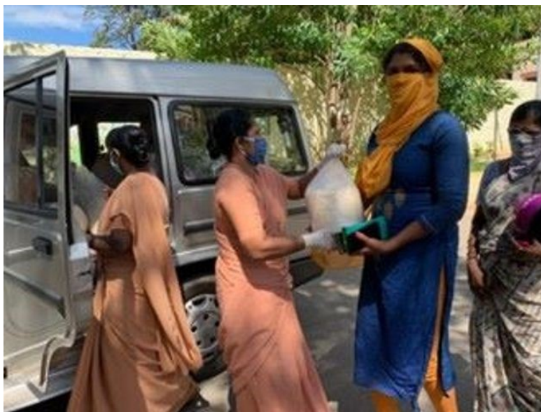
There is greater joy in giving than in receiving

Never forget the poor is a key word of Blessed Marie Louise which she lived all through her life spent in the care and service for the poor. The Daughters of Wisdom of the Province of India strive to imitate the values of Marie Louise through their various missions of social service, education and health.