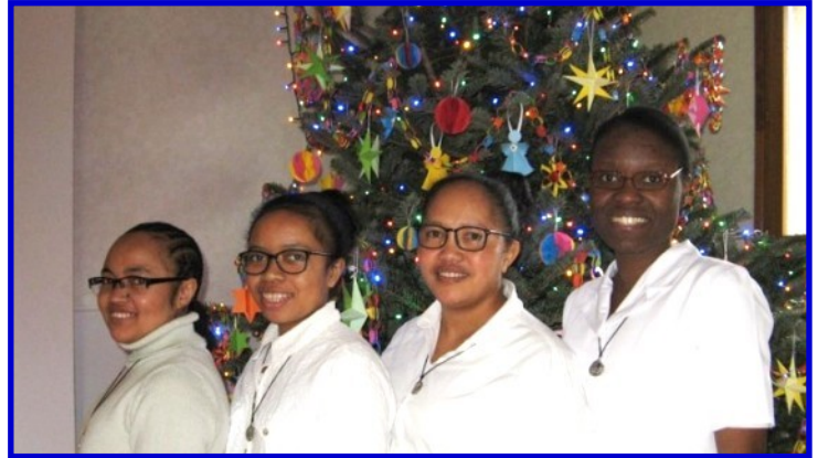
Novices of Clamart

The God of all Majesty came in our humanity to be one of us. Hymn 57