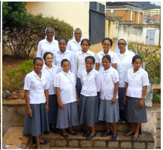
Pre-novices and 2 Sisters in charge