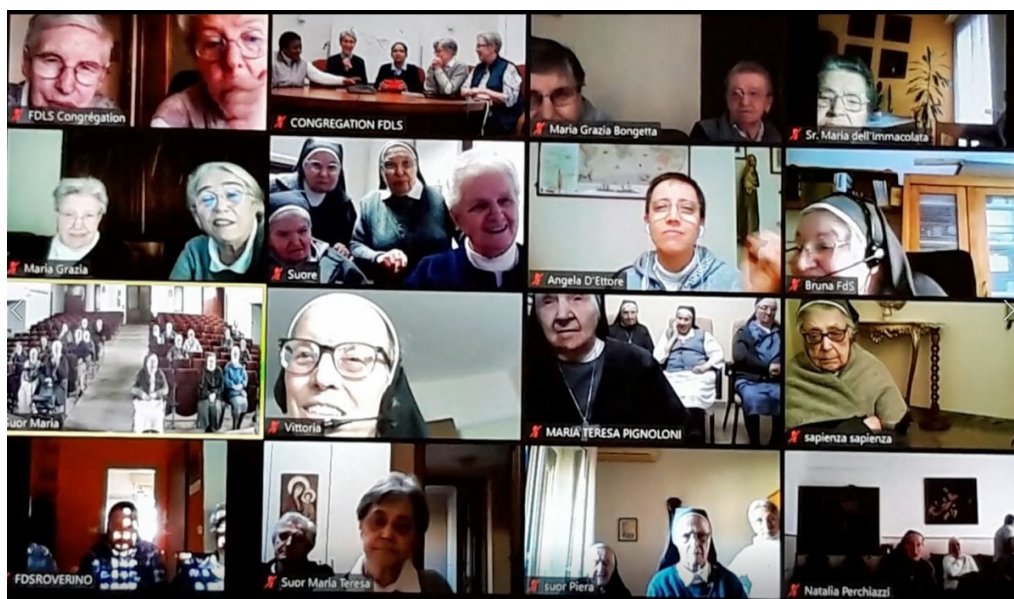
The Sisters of the Province of Italy

The joy of meeting each other in person!