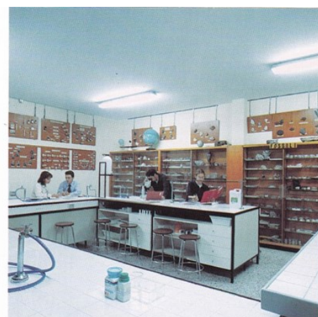
Laboratorio di Chimica

The beginnings were not easy; committed to both the classes in Bergamo and those that were gradually opening up in Clusone, the teachers were overworked. But the sacrifices soon bore fruit, "like the grain of which the Gospel speaks, which, if it dies, bears much fruit" . Immediately, the enrollment was so great that two sections were needed for the first class.