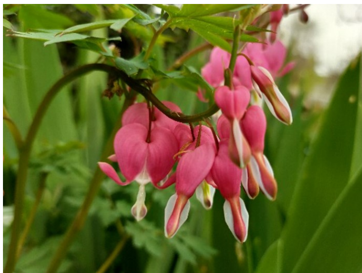
This flower is called a heart of Mary