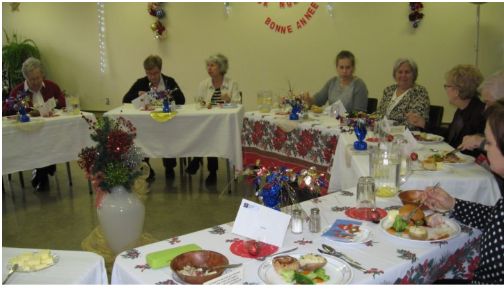
Meeting between the sisters and the persons in charge of various organizations that use the Relais Sageesse premises.