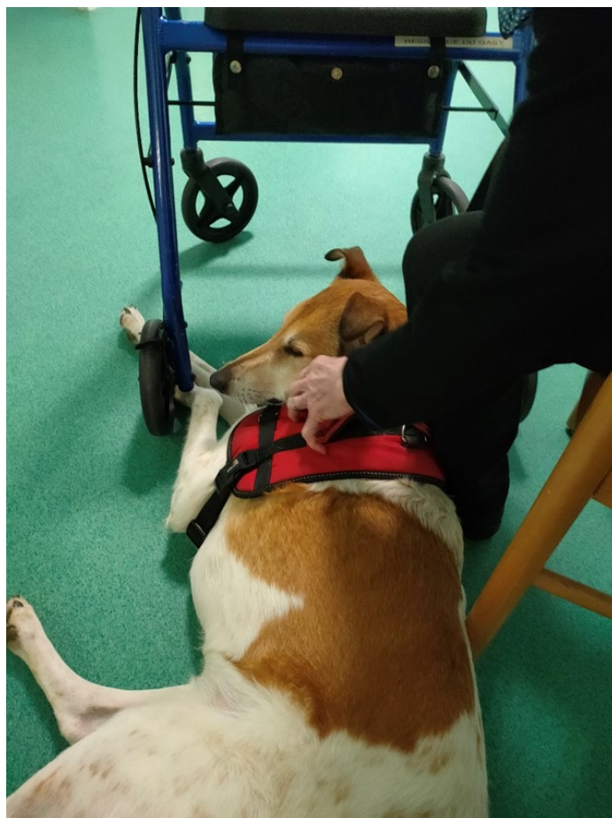
Visit of the dog to the elderly