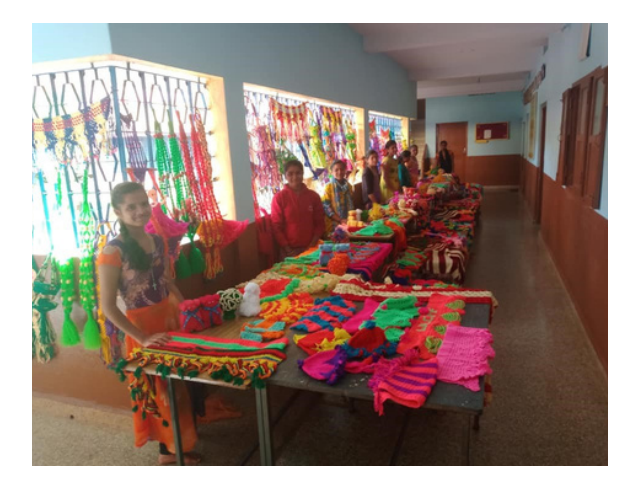
Celebrating life as the gift of God

and mission of JPIC and build up more partnerships for the protection of children and adults from the marginalized and vulnerable communities.