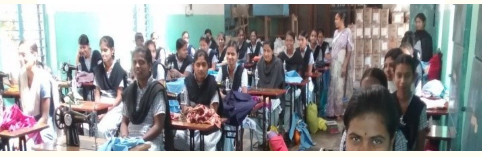
Through TAILORIGN AND KNEETING they are able to support the family financially