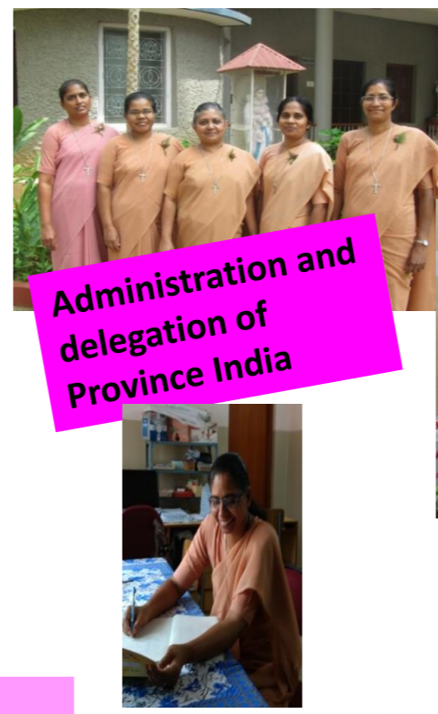
Administration and delegation of Province India