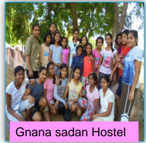
Gnana sadan Hostel