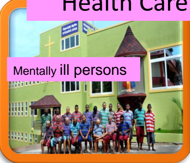
Mentally ill persons