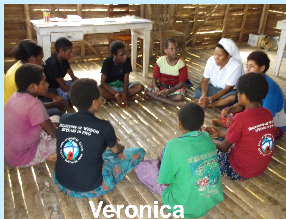
Veronica Vocation Promotion