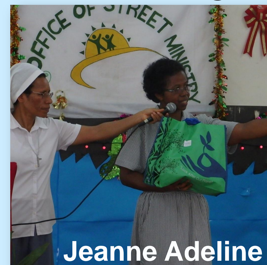
Jeanne Adeline Street Ministry