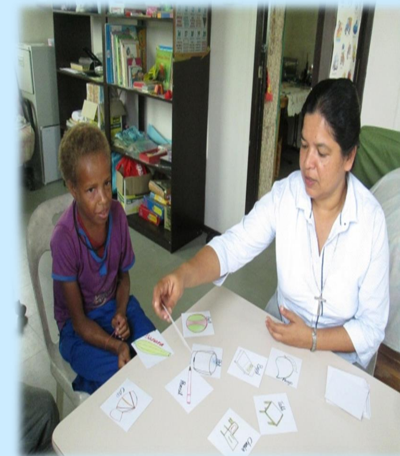
Shiny Speech therapy