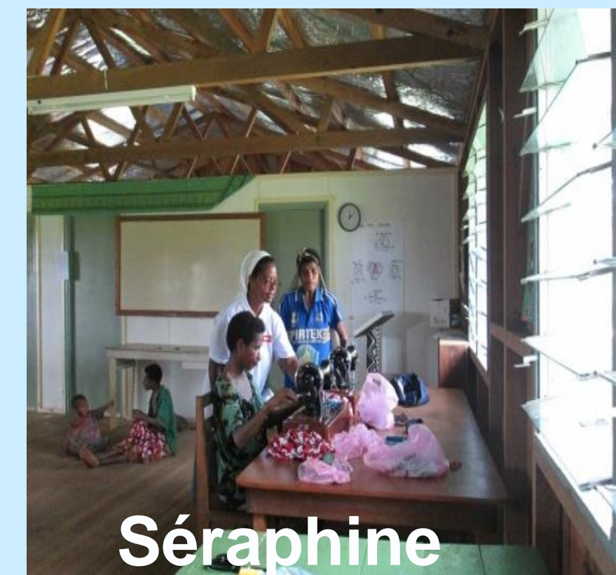
Séraphine Rural Promotion