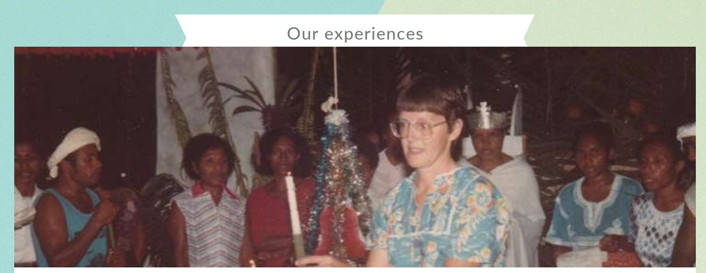
I represent Catholics in an ecumenical service.

At first the UN and the government provide rice, canned meat and fish, soap, salt, tea, sugar, and materials to build a shelter. During this time, the refugees are asked to start a garden and prepare bush materials to build a more permanent home. This lasts for a year or two, and then gradually the refugees must learn to be selfsufficient - something they find difficult.