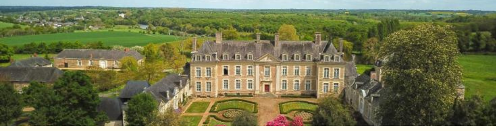
The Magnanne castle

Confirmed in his vocation as a layman, yet unable to preach, he chose to write and publish books at