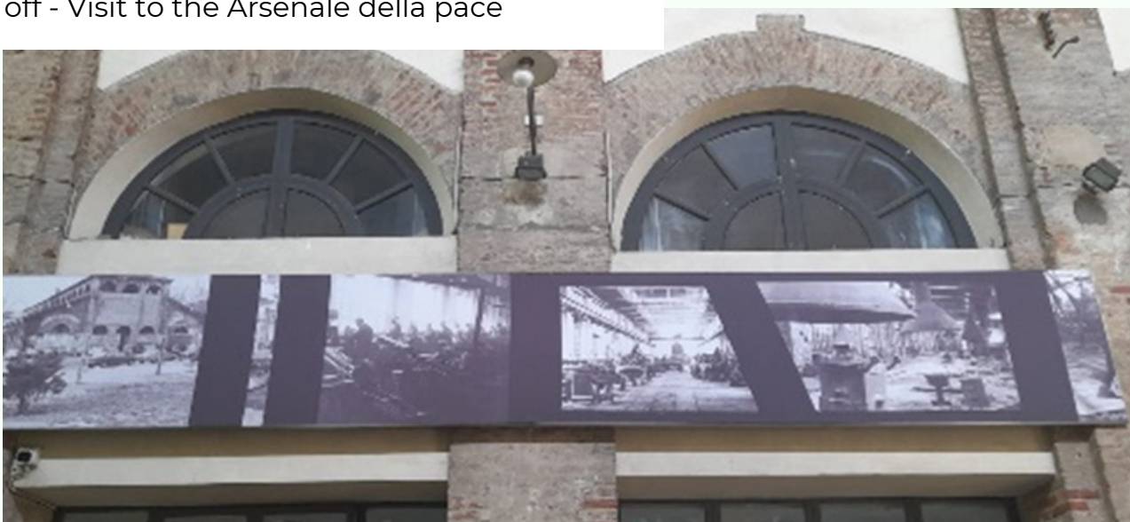
Day off - Visit to the Arsenale della pace

The main entrance to the former Italian arms factory, built before the First World War.