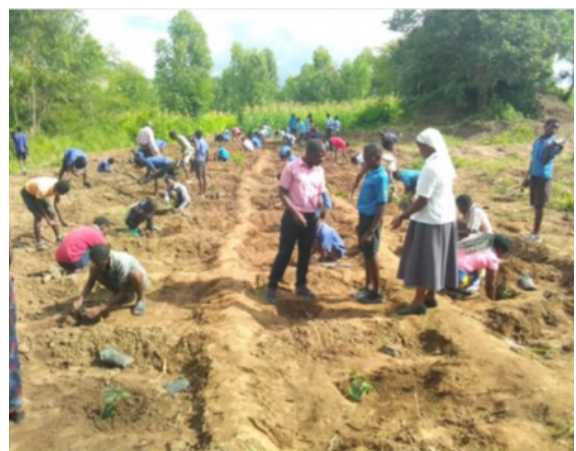
Teachers and learners at Nguludi taking the responsibility of caring for the Mother Earth by planting trees.

At Nguludi Boys Primary School, children are not only encouraged to restore the environment but also to clean the environment by sweeping the surroundings.