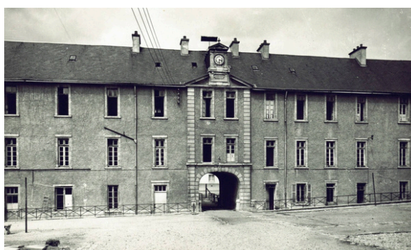
L'ancien porche de l'Hôpital de Poitiers.

This humble group—crippled but possessing exquisite souls—practiced part of The Rule of Wisdom. In Montfort's mind, this group was merely a preparatory association for what would later become the Daughters of Wisdom Institute.