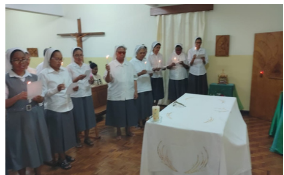
The sisters in Antsakaviro communities

At the conclusion of this day with consecrated persons, during Vespers, the Daughters of Wisdom from two communities in Antsakaviro—Notre-Dame de la Joie and Marie de Nazareth—renewed their vows together during a Vespers celebration. This time of prayer, held in the chapel of the provincial house, was a moment of profound reflection and renewed commitment for each member.